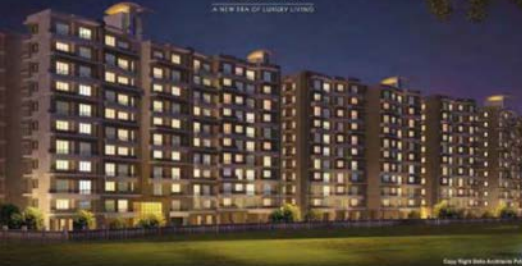
Class High Rise Architecture Pvt.

What inspired you to study/practice architecture? What are the attributes needed to become a successful architect and interior designer?